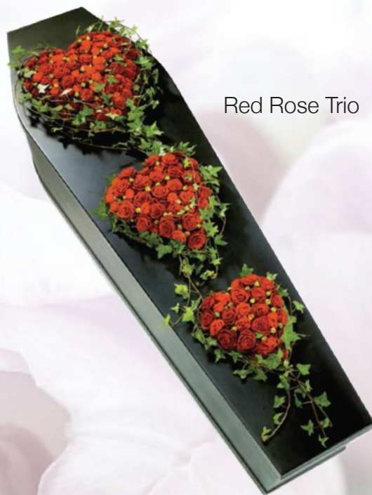
Red Rose Trio

We have a flower brochure available or Sophie can meet with you to discuss your requirements.