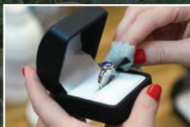
Cremated Remains Jewellery

There are many different keepsakes and memorials available, including cremated remains jewellery, fingerprint jewellery, birdbaths, sundials, memorial benches to name a few.