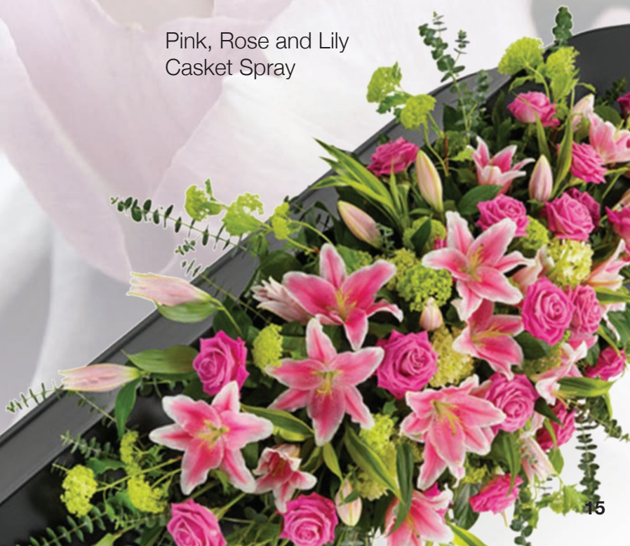
Pink, Rose and Lily Casket Spray